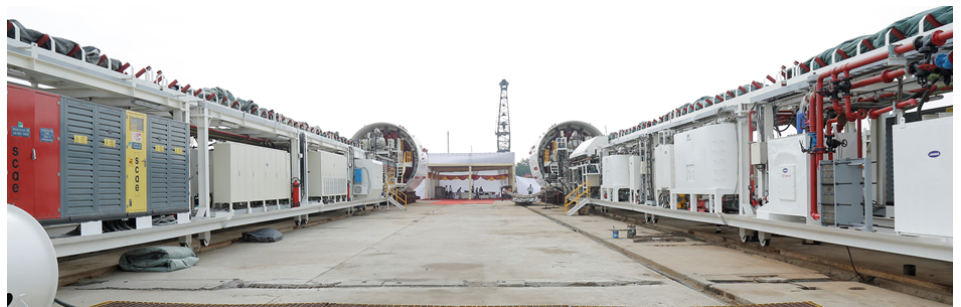
Rear view of TBM with support gantries