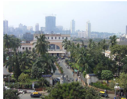
Forecourt of Mumbai Central Railway Station