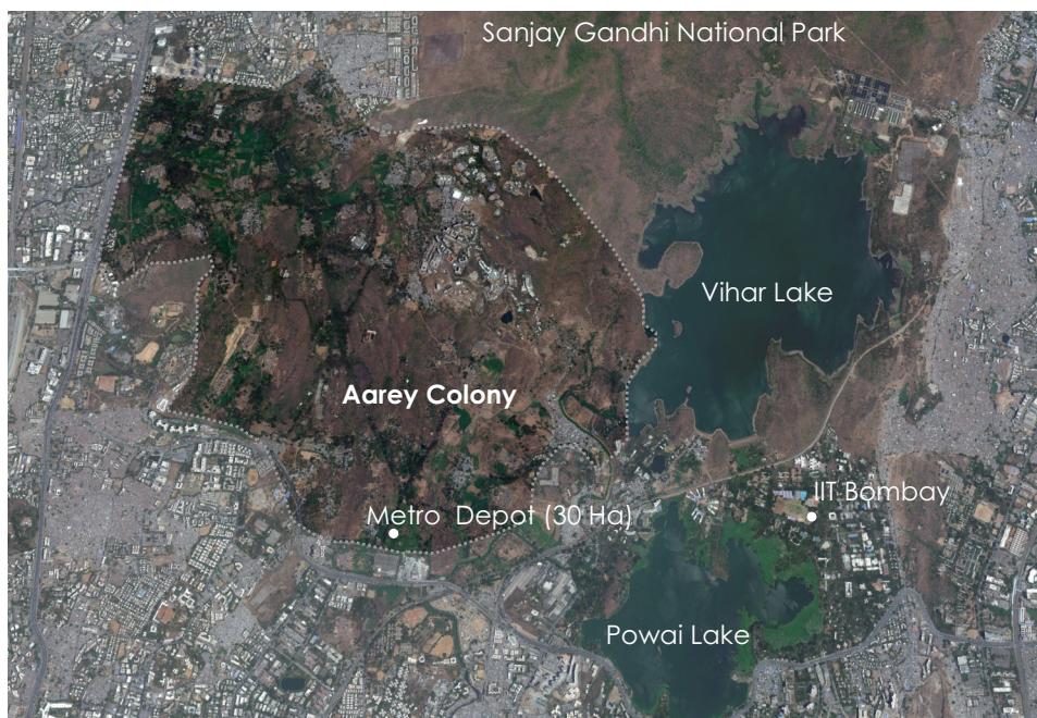
The Aarey colony shares its borders with the Sanjay Gandhi National Park. Traveling on these internal Aarey roads does give an impression that one is in a forest, but a satellite image of the area tells us the true situation.

Mumbai hitherto had areas, where normal development could take place, and the Non-Development Zone (NDZ) areas which are now been re-categorised as Special Development (SDZ) Zone I and Zone II, paving the way for development of what was earlier NDZ.