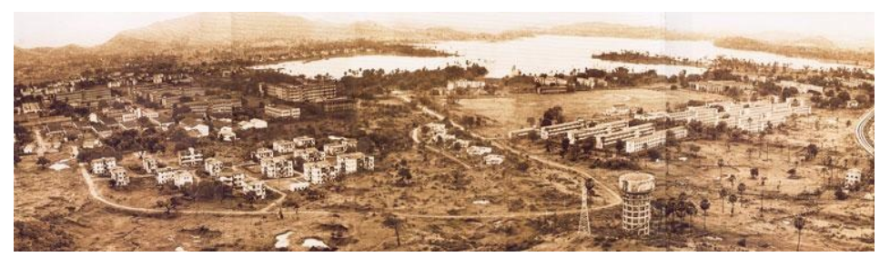
Surroundings of IIT Bombay, year 1958