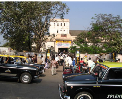
View of Station from Bellasis Bridge