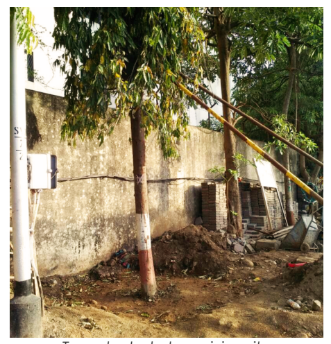
Tree planted at receiving site