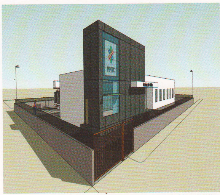
A Concept 3D model of MMRC's Green Building RSS

Special Green Features of MMRC's Substations: Each RSS will be constructed in a compact area of 2200 Sq.m by using GIS technology. Use of new GIS system gives space saving of around 60 % viz a viz conventional system. Apart from this, MMRC envisages to construct its Receiving Substations on Green Building Concept.